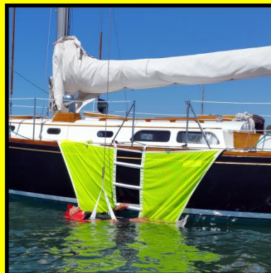
OR HOIST CREW UP WITH YOUR BLOCK, TACKLE / HALYARD