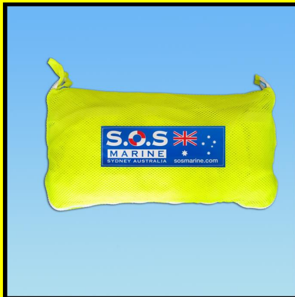
COMPACT AND PORTABLE

Conscious, uninjured victim uses ladder, otherwise parbuckle lift!