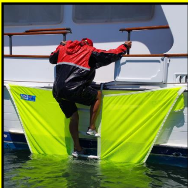
USE AS LADDER